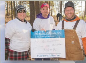
"For the remembrance of the ones who served before us"