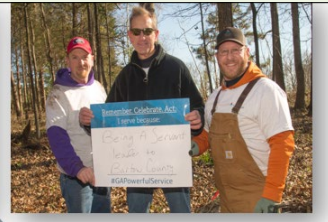
"Being a Servant Leader to Bartow County"