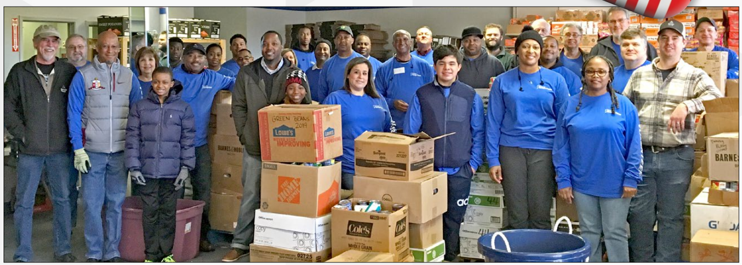
Plant Yates Chapter – Citizens members from Plant Yates sorted food at One Roof Ecumenical.