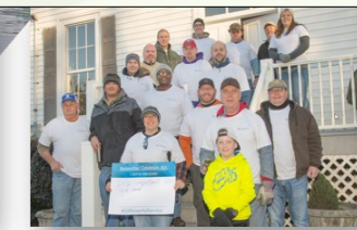
"It's important to give back"