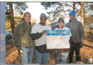
"Blessing to give than to receive"