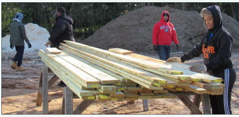
Dublin Chapter – Dublin Citizens members made sure WINGS Shelter is looking good for its residents.