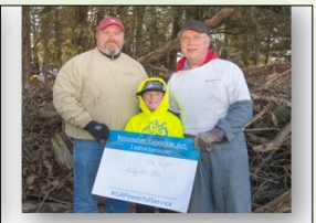
"It's the right thing to do!"