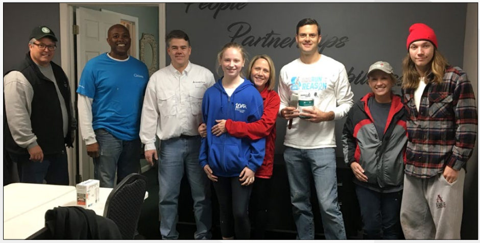
Metro West Chapter – Metro West Citizens showed up in force at both Cherokee FOCUS and Davis Direction Foundation.